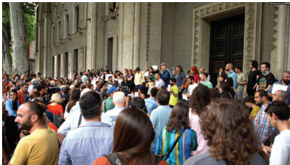
Museum workers protest around the Georgian National Museum against the Ministry of Culture's actions, which include multiple layoffs of museum workers and specialists.