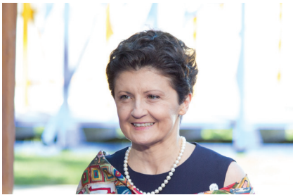
Minister of Culture, Sport, and Youth Affairs Tea Tsulukiani pictured at a meeting in her former role as justice minister in 2017.

One particularly striking pattern has been the Ministry of Culture's interference in the system of selecting and appointing leaders of the country's major cultural institutions, including by placing individuals without relevant expertise in decision-making roles and undermining previously transparent processes. One significant impact of this new process has been to limit and undermine the influence and work of independent, qualified professionals in the cultural sphere. Decision-making and control are now in the hands of a few ministry appointees, who seek to exclude people who are not in line with the current government's views. In many instances, the ministry has effectively deprived these formerly independent institutions of any power to make decisions about staffing, budgets and related issues.