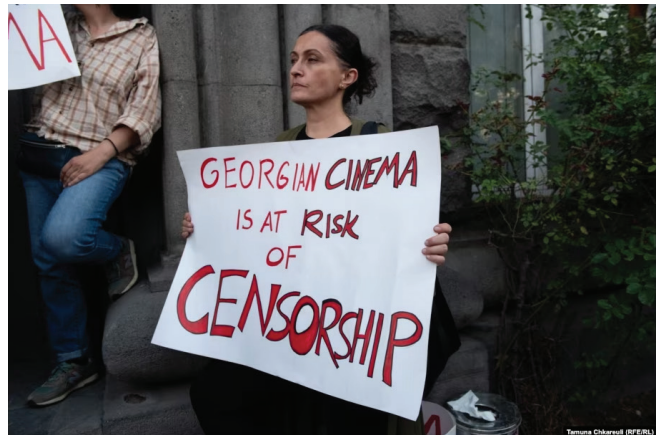
Protesters rallied against the developments at the Georgian National Film Center (GNFC) following actions by the Ministry of Culture that threaten independence of the institution.