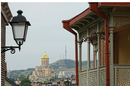
The Old Town in Tbilisi, Georgia.