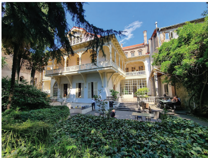
The Writers' House in Tbilisi has hosted one of Georgia's most consequential literary awards since 2015.

PEN Georgia, a literary organization of more than 70 Georgian writers and a member of the global PEN International network, described this change as echoing Soviet-era "appointments of representatives of the Soviet state to contest juries, mandated to reject submissions incompatible with party ethos." 23