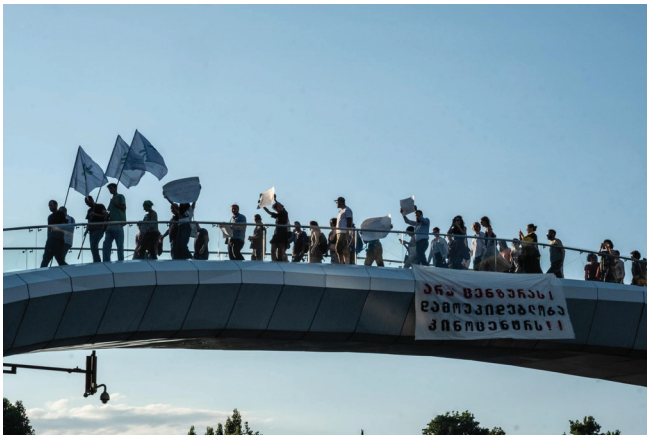
Protesters hold a sign saying, “No to censorship! Independence to the film center!”

There has been vocal condemnation of these actions against the GNFC from the center’s employees and civil society. In mid-June, film center employees issued another public letter demanding a halt to the reorganization, pending the selection of the new director through a fair, transparent, and competitive process by a panel of film industry professionals. Representatives of the Georgian filmmaking industry also signed the letter. 84 Sixty writers immediately issued a solidarity letter in support of an independent GNFC; 85 numerous independent Georgian and international human rights organizations also signed a letter condemning threats to freedom of expression in Georgia. 86