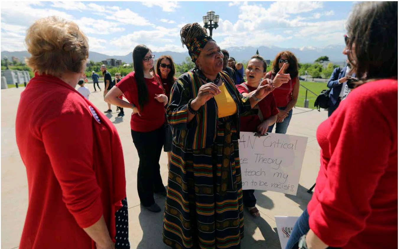
Supporters and opponents of Utah's educational gag order bill speak to each other outside the state Capitol in Salt Lake City, May 19, 2021.

Of the bills that explicitly ban specific educational initiatives, only two—Texas's HB 3979 and SB 3, which include a specific prohibition for The 1619 Project—have become law. As of this writing, three pending bills target The 1619 Project—Michigan's SB 460, New York's A8253, and South Carolina's HB 4343. Yet even without singling out curricula by name, 53 of the 54 educational gag order bills PEN America examined (all except the Tennessee anti-LGBTQ+ bill) could be used to block The 1619 Project or any other educational approach that could be seen as teaching “prohibited” ideas on racism or sexism. This includes the eleven bills that have already become law.