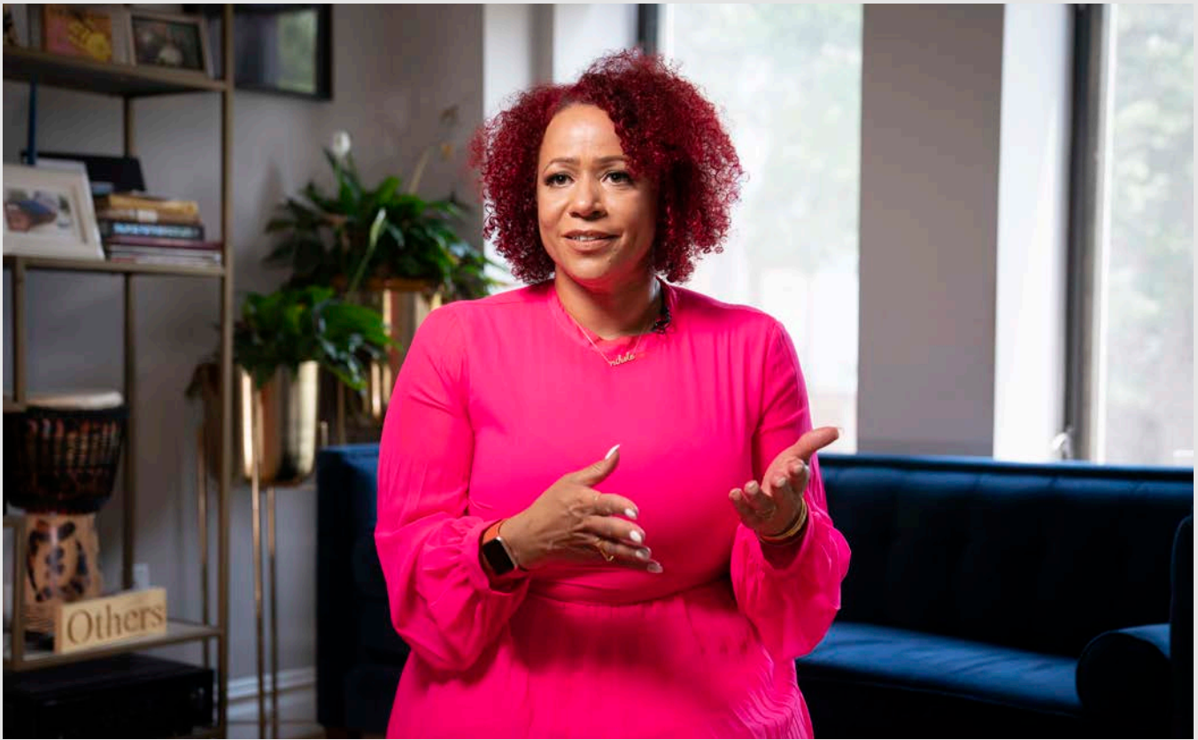
Nikole Hannah-Jones being interviewed in 2021. Hannah-Jones has led The New York Times 's "The 1619 Project," which has aimed to "reframe the country's history by placing the consequences of slavery and the contributions of black Americans at the very center of our national narrative."