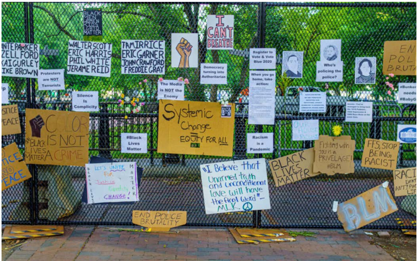
A wall of protest over police brutality. As many Americans and U.S. institutions have attempted a true reckoning with the role that race and racism play in American history and society, certain Republican legislators and conservative activists have capitalized on this backlash.

es where bills themselves either contained obvious mistakes of historical fact, or were identifiably based on blinkered or ill-formed perspectives on American history. Mississippi Senate Bill 2538, which seeks to cut off state funding from any school that teaches The 1619 Project, includes the false declaration that “the true date of America’s founding is July 4, 1775.” 179 This is, almost certainly, a typo. Yet it is an instructive typo, as it illustrates the dangers of attempting to legislate the teaching of history.