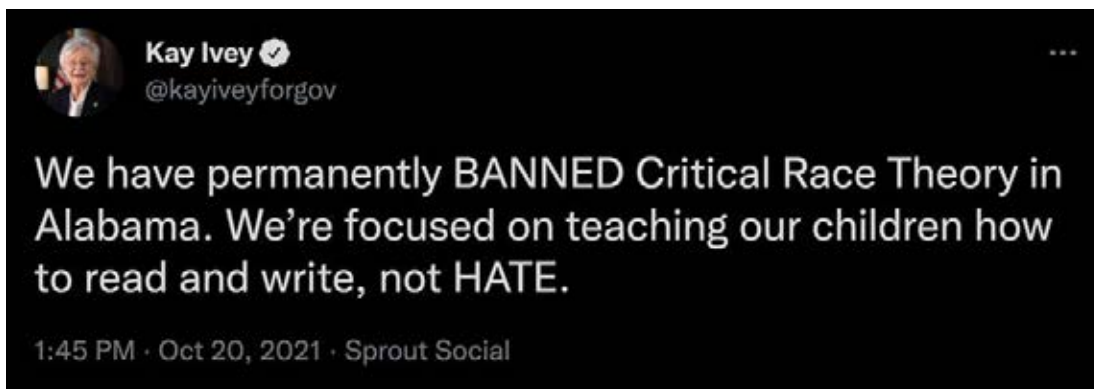
Alabama Governor Kay Ivey voices her support for banning critical race theory on Twitter. Over the past year, some Republican officials have become increasingly vocal about their efforts to legislate bans on critical race theory in educational institutions.

within their wide sweep. Faced with these impossible demands to parse out which concepts are illegal to introduce into the classroom or how to educate students on a concept without appearing to “endorse” it, it is far more likely that teachers will ground their interpretation not only in the letter of the law, but also in the perceived intent of the legislators who promoted the law—an intent that these legislators have loudly telegraphed.