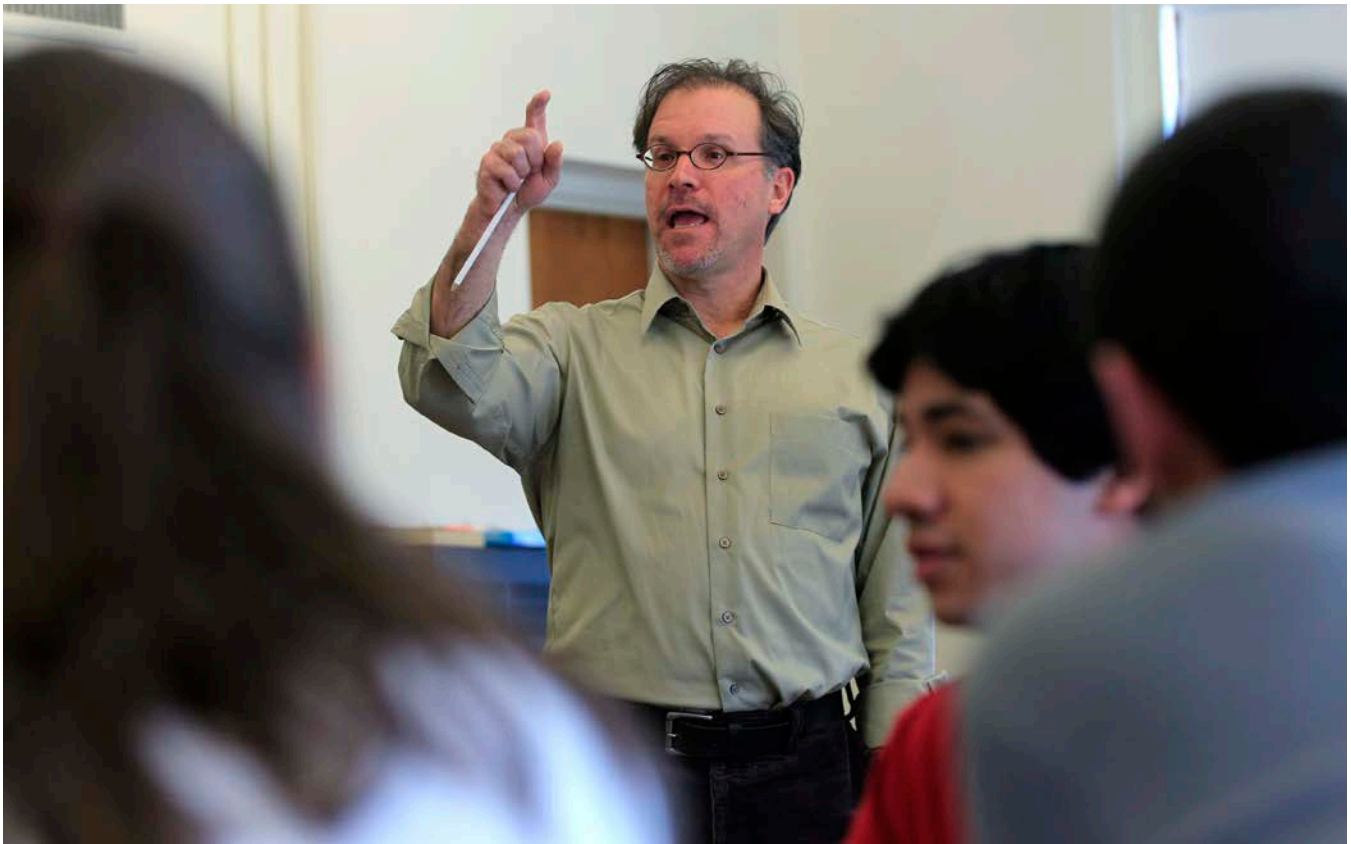
A scene from a college classroom in Massachusetts. Educational gag orders send a message to teachers that the government may target them for allowing “prohibited ideas” in their classroom.