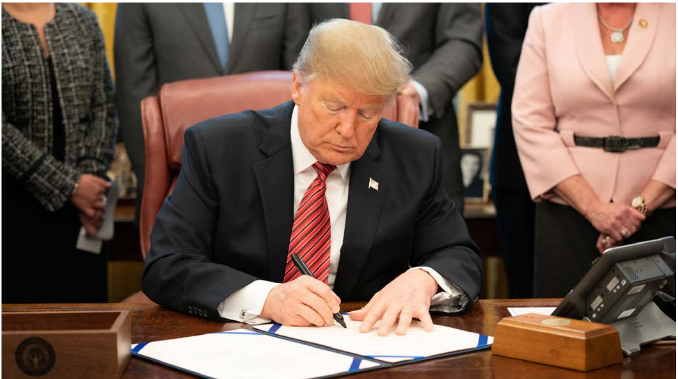
President Donald Trump signs an executive order. On September 22, 2020 he signed EO 13950, “Combating Race and Sex Stereotyping” which included a list of prohibited “divisive concepts” which has been copied by legislatures across the country.

has warped, distorted, and defiled the American story with deceptions, falsehoods, and lies,” identifying certain efforts by name as especially pernicious: “Critical race theory, The 1619 Project, and the crusade against American history is toxic propaganda, ideological poison that, if not removed, will dissolve the civic bonds that tie us together. It will destroy our country.” 39 To fight back, he announced the formation of a “1776 Commission” to promote “patriotic education.” 40