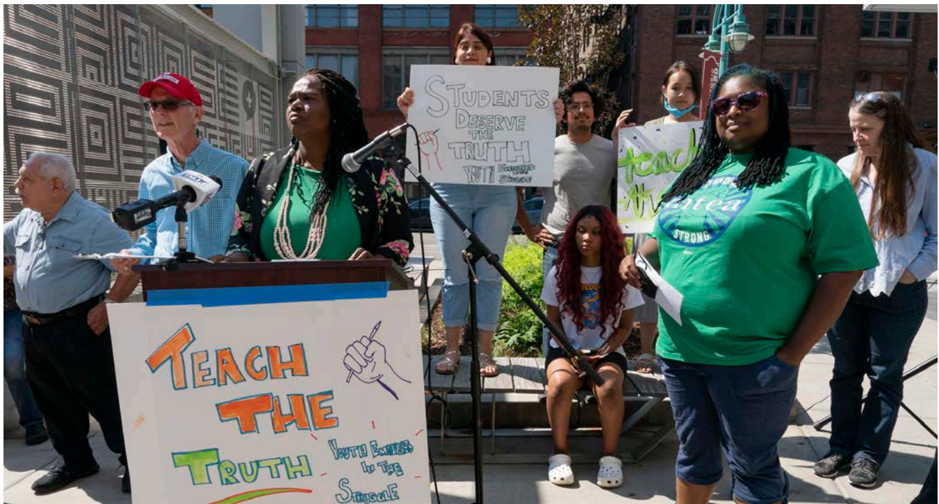
"Teach the Truth" Rally in Milwaukee on June 12, 2021, as part of the National Day of Action organized by the Zinn Education Project and Black Lives Matter at School.

These bills will have—and are already having—tangible consequences for both American education and democracy, both distorting the lens through which the next generation will study American history and society and undermining the hallmarks of liberal education that have set the U.S. system apart from those of authoritarian countries. In a very short time, we have already seen the chilling effects of this kind of legislation, which has been used to justify suspending a sociology course on race and ethnicity in Oklahoma, 8 providing professors at Iowa State University written guidance for how to avoid 'drawing scrutiny' for their teaching under their state's Act, 9 instructing