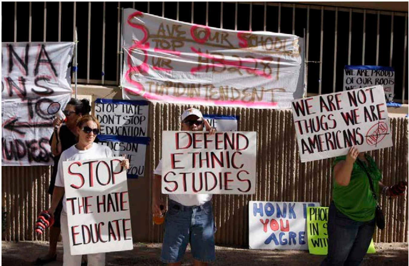
In 2011, protesters gathered to support the Tucson Unified School District after the announcement that its Mexican American Studies Department's ethnic studies program violated state law.