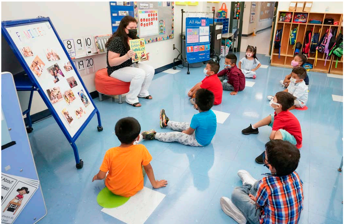
A pre-K teacher reads with students in her classroom in Palisades Park, NJ. Routine storytelling stands to be chilled by educational gag orders around the country.

schools or high schools," said Randi Weingarten, president of the American Federation of Teachers, the country's second-largest teacher's union. "It's a method of examination taught in law school and college that helps analyze whether systemic racism exists." 176