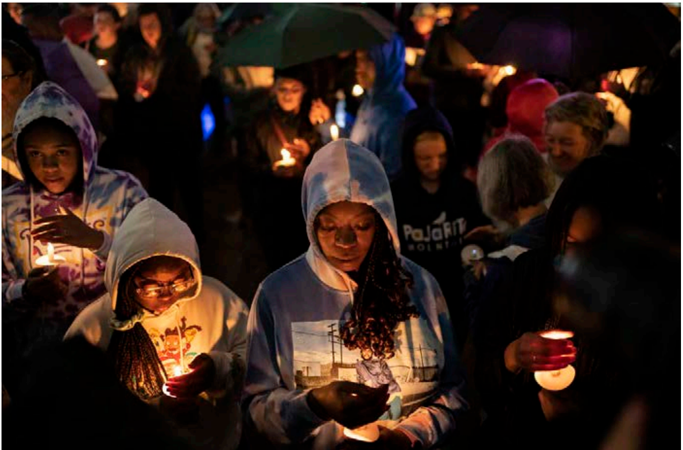
People hold candles during a vigil for the centennial commemorations of the Tulsa Race Massacre in the historic Greenwood neighborhood, May 31, 2021, in Tulsa, OK.

was sure that critical race theory had no place in Utah's curriculum, "the difficulty . . . comes in defining terms and making sure that we are never stifling thought or expression—and that we make sure our children learn both the best of our past as well as our mistakes so we don't repeat them." He added: "We must also make it abundantly clear that Utah is a place that welcomes everyone regardless of race, ethnicity, religion or any other background. It is who we are, and it may be easy to lose sight of that during a knee-jerk debate." 115